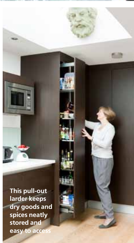
This pull-out larder keeps dry goods and spices neatly stored and easy to access

● Joyce and Tony used Amberth Kitchens, 311 Essex Road, London N1 2YG. Call 020 7354 8958 or visit amberth.eu