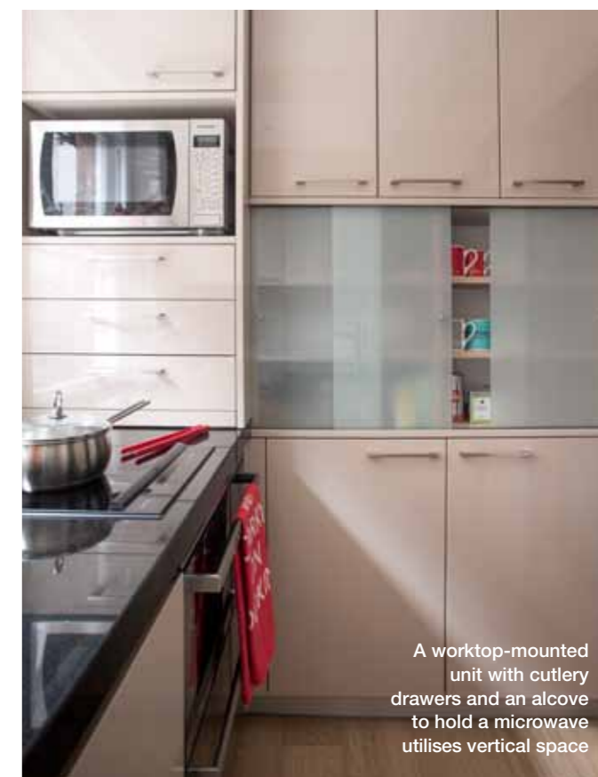
A worktop-mounted unit with cutlery drawers and an alcove to hold a microwave utilises vertical space